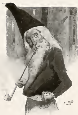
The Little Glass-man.

IF ever you should travel through the country of Suabia you should take a peep at the Black Forest, not only that you may admire the magnificent pinetrees, but that you may study the people living there, for they are quite unlike any of their neighbours. The inhabitants of the Black Forest near the town of Baden are tall and broad and it would almost